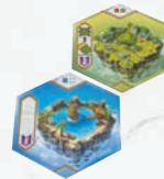
Invalid placement: a tile must be placed on two tiles of the previous row.

➤ At least one of those two tiles must be of the same color than the newly placed tile.