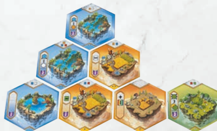
This universe is valid.