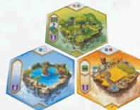
Invalid placement: one of the tiles of the previous row must be of the same color than the newly placed tile.

➤ At least one of those two tiles must be of the same color than the newly placed tile.